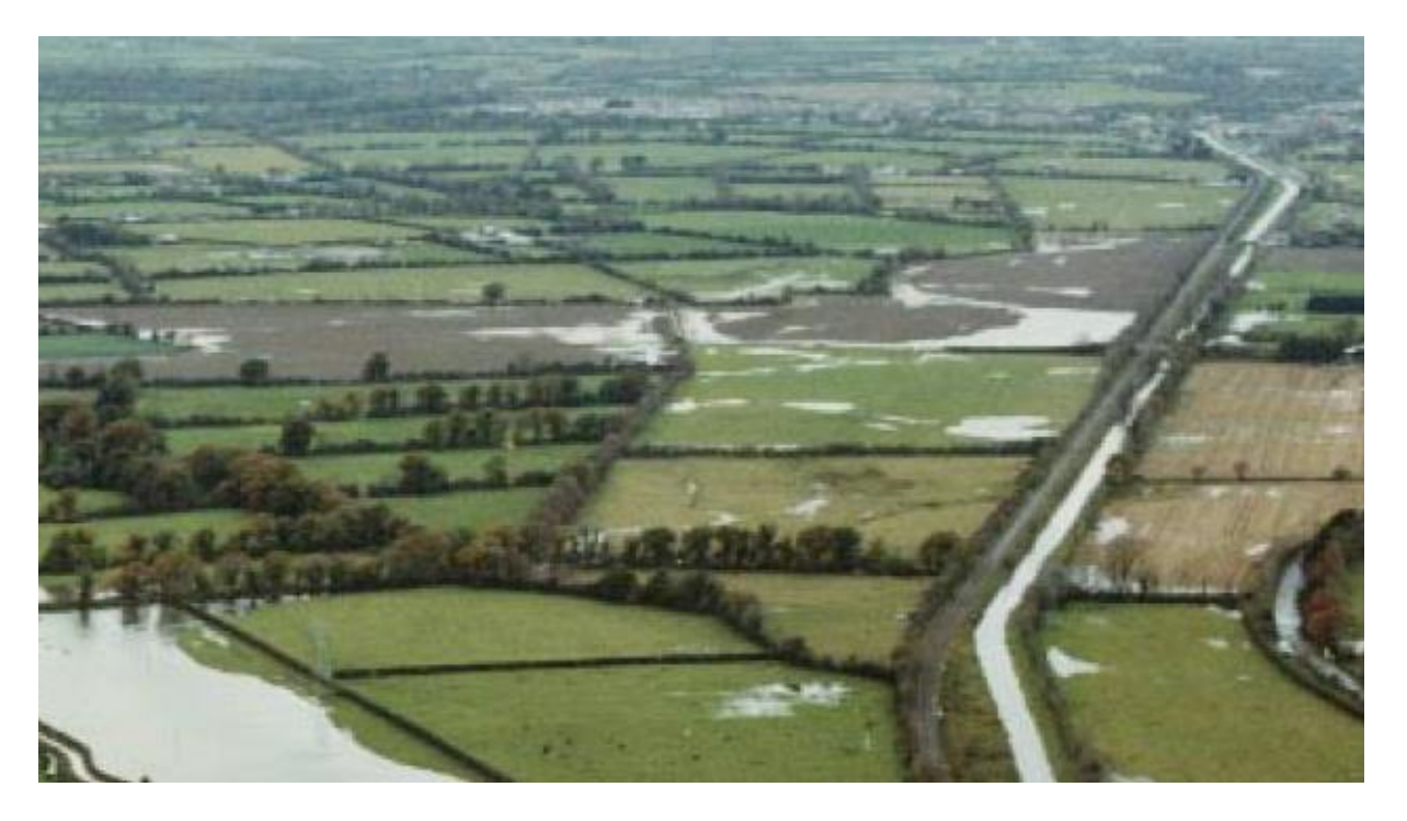
Figure 10-3 Flooding south of Bailey's bridge November 2000

receptors are very similar to those seen in the current climate scenario with an increase in flood extents further downstream towards the Ballycaghan Stream confluence with the Lyreen River.